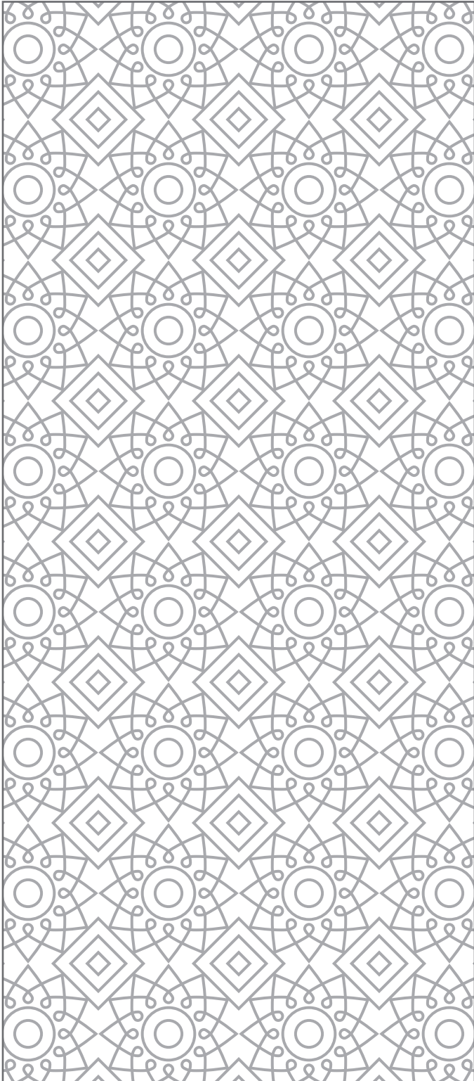
Pattern - HPG_ORI_015