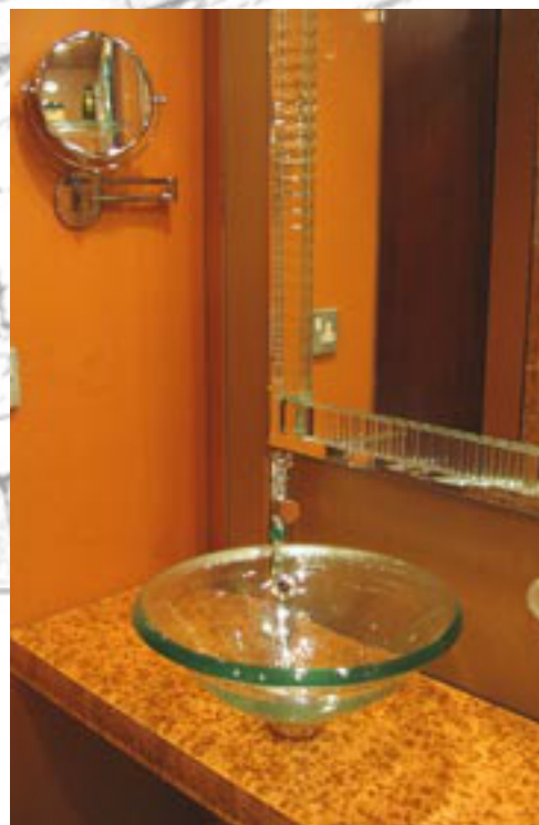
Top: Andrex Vermont Gateway, Gardena, CA. Andrex Development Company. Two Color OPACI-COAT-300®.